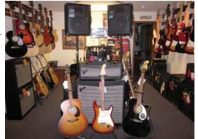
Randall's Guitar School & Music Shop, 1008 Summit Street, is open by appointment.