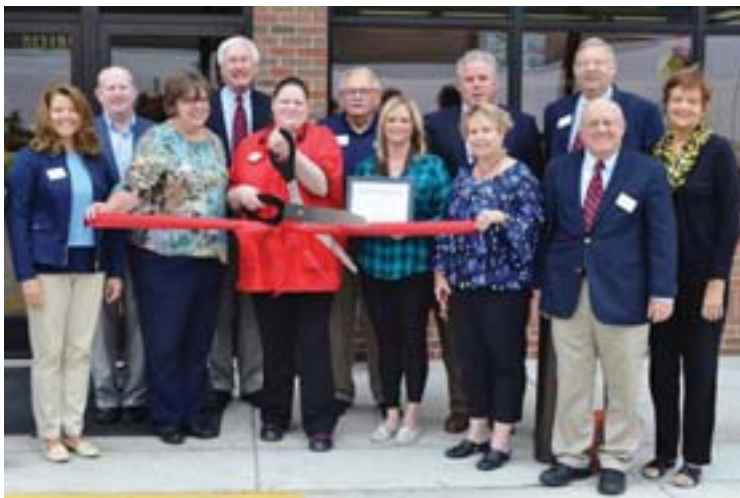
Left: Managers and staff of Casey's General Stores and Chamber Ambassadors celebrated the opening of the new store (108 Iowa Avenue West) with a ribbon cutting on September 30.