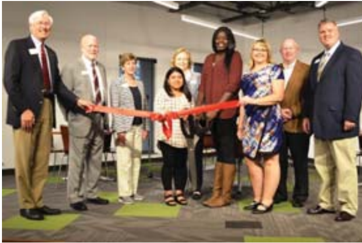
Left: Marshalltown Community College administration and Chamber Ambassadors cut the ribbon on the newly remodeled MCC William “Bill” Faust Student Union (3700 South Center Street) on September 22.