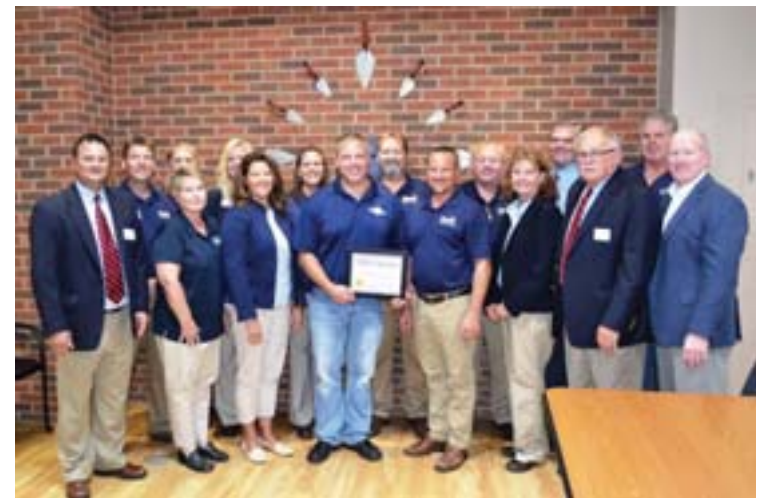
Right: Management of Marshalltown Company (104 South 8th Avenue) gave Chamber Ambassadors a tour of the manufacturing facility during a courtesy call on October 11.