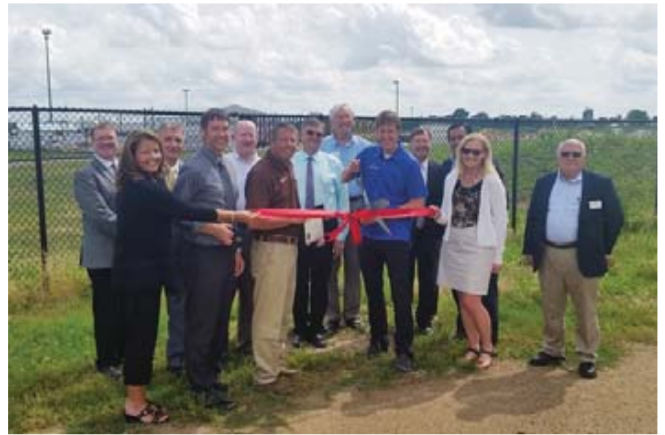
Members of the Menard's corporate team, Chamber Ambassadors, and community leaders cut the ribbon on the new Midwest Manufacturing facility (South 18th Avenue & East Olive) on June 30.