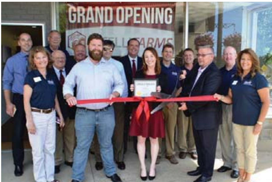
Chamber Ambassadors and IntelliFarms staff cut the ribbon to celebrate the company's grand opening of their Marshalltown location (134 West Main Street) on July 12.