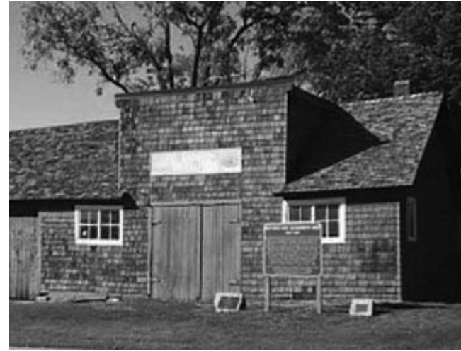
The Matthew Edel Blacksmith Shop is located at 214 First Street in the heart of Haverhill.