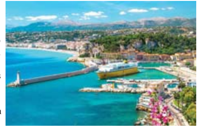
This year's Chamber Experience trip departs November 1 for nine days.