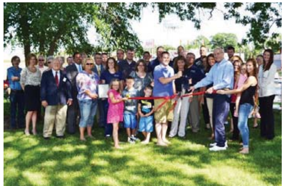
IVL 2016 class members, FCC Trustees, community leaders, donors, and Chamber Ambassadors gathered on July 12 for a ribbon cutting at the renovated Fisher Community Center pond (709 South Center Street).

Photos of past Ambassadors' Courtesy Calls and Ribbon Cuttings are posted on the Chamber's website at www.marshalltown.org .