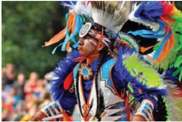
The 102nd Annual Meskwaki Powwow will be held August 11 to 14.

The annual Meskwaki Powwow will be held August 11-14 at the Powwow site, historically known as the “Old Battleground” located four miles west of Tama on Hwy E-49, along the east bank of the Iowa River. The site is near the original 80 acres of the Meskwaki Settlement.