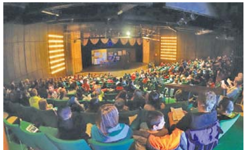
The beautiful Martha-Ellen Tye Playhouse auditorium has been home to Marshalltown Community Theatre since 1970.

For information on getting involved or lending financial support, call MCT’s Box Office at (641) 752-4164 and leave a message. Or, call Lowe’s Flowers at (641) 752-4601.