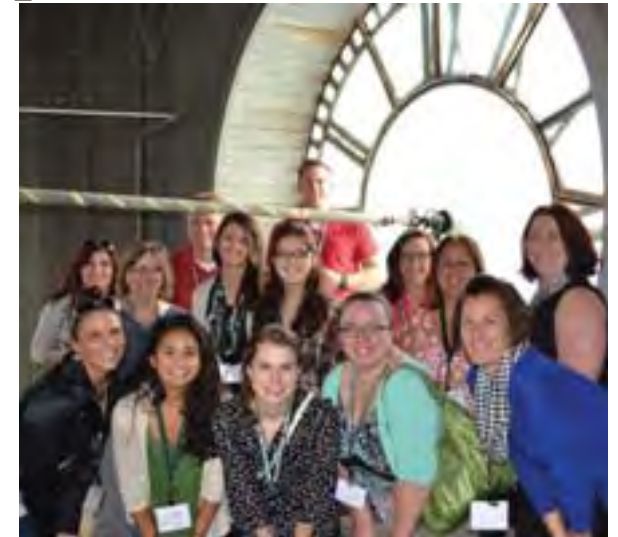
The IVL class in the courthouse clock tower on Marshalltown History Day.

The purpose of the IVL class is to empower individuals to become active community leaders and influence positive change. To this end, class members spend nine months learning about the community through meeting a variety of local leaders, being exposed to numerous businesses and organizations, as well as having educational visits and experiences throughout the Marshall County area. IVL participants also choose a class project to complete for the benefit of the community. Started in the 1980s, the program is co-sponsored by Marshalltown Area Chamber of Commerce and Iowa Valley Continuing Education.