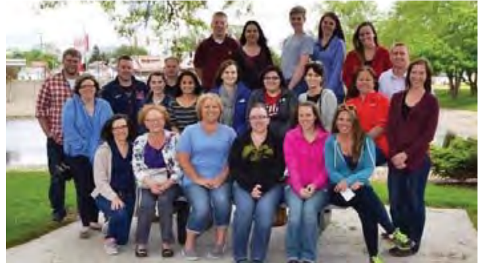
The 2016 IVL Class at their FCC pond rejuvenation project.