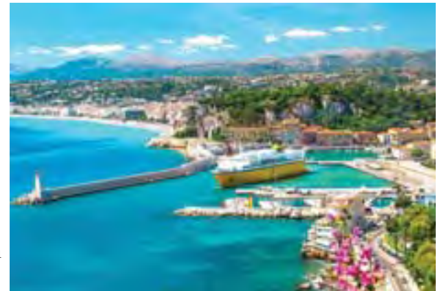
This year's Chamber Experience trip departs November 1 for nine days.