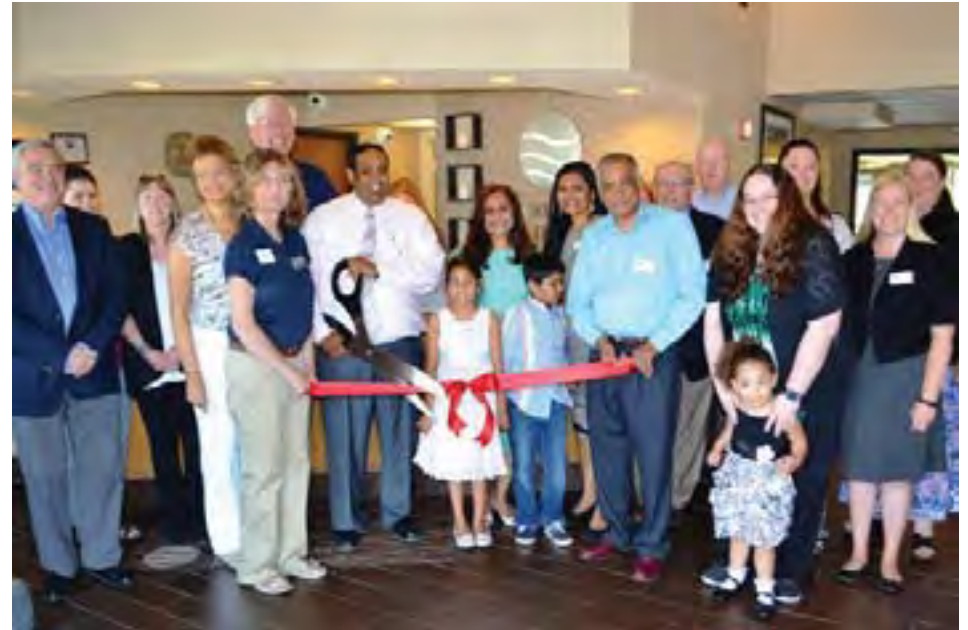
Comfort Inn & Suites (2613 South Center Street) owners, staff and Chamber Ambassadors cut the ribbon at the grand re-opening of the newly remodeled facility on June 9.