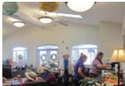
Aptly named, the bright and welcoming Gathering Room is perfect for parties and other gathering activities.