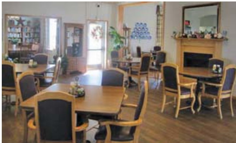
Just off the dining room is the free-access resident library.

Residents living in apartments can choose from studio, 1- and 2-bedroom floor plans, all with walk-in showers and kitchenettes. Included in their monthly plans are three home-cooked meals a day, housekeeping, laundry, and a variety of