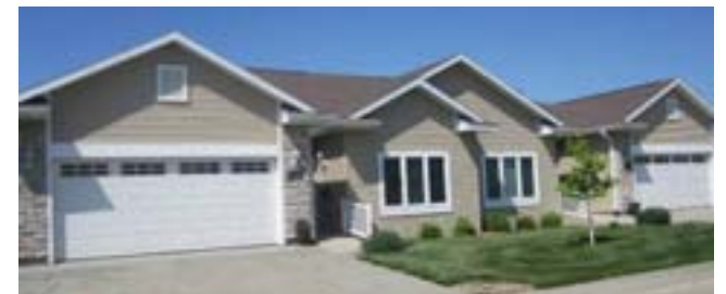
The community also features six 3-bedroom, 3-bath townhomes.

Chamber members will have the opportunity to view the facility at the Wednesday, June 15 Business After Hours hosted by Glenwood Place. All employees of Chamber member businesses and organizations are invited to the event which takes place from 4:30 to 6:30 p.m.