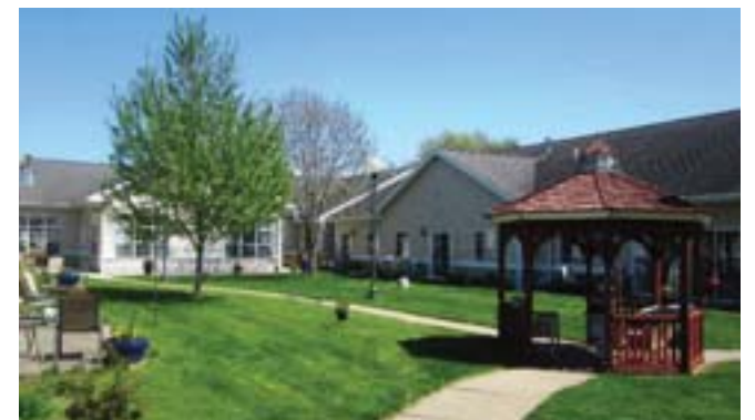
Many of the apartments have patios leading to an attractive enclosed central courtyard.