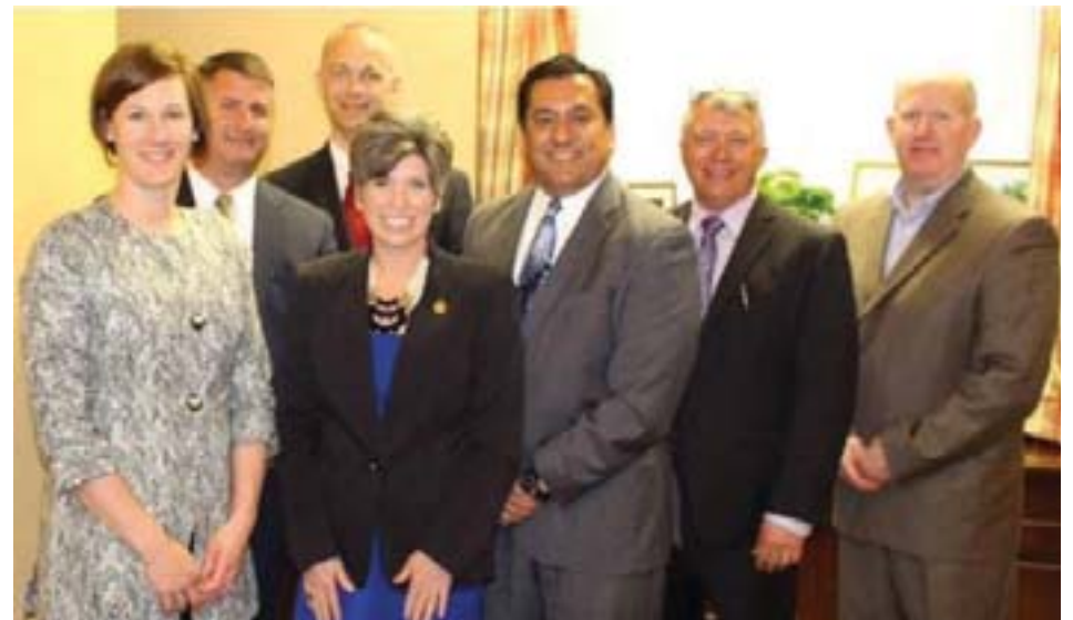
A delegation of Marshall County business leaders traveled to Washington D.C. April 26-28 to visit with Senators Joni Ernst and Charles Grassley, Representative Rod Blum, and their staff members about areas of concern to our community. The annual event is sponsored by the Marshalltown Regional Partnership (MRP).

Photos of past Ambassadors' Courtesy Calls and Ribbon Cuttings are posted on the Chamber's website at www.marshalltown.org .