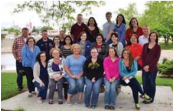
The Iowa Valley Leadership Class of 2015-16 poses in front of their class project: beautification of the Fisher Community Center pond which involved clean-up, landscaping and adding seating.

The Iowa Valley Leadership program recently graduated 26 students who participated in the September 2015 to May 2016 class sessions. Participants represented a diverse cross-section of area businesses, organizations, and educational institutions, including four Marshalltown High School juniors.