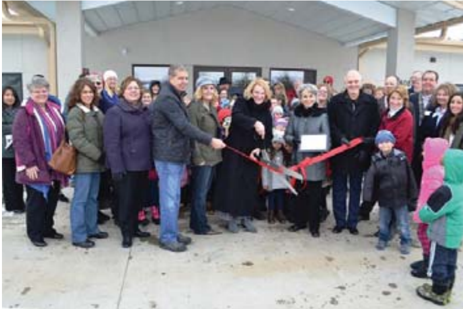
Marshalltown Christian School staff, students, and supporters celebrate the first day of classes in their new building (1408 South 7th Avenue) with a ribbon cutting on January 6.