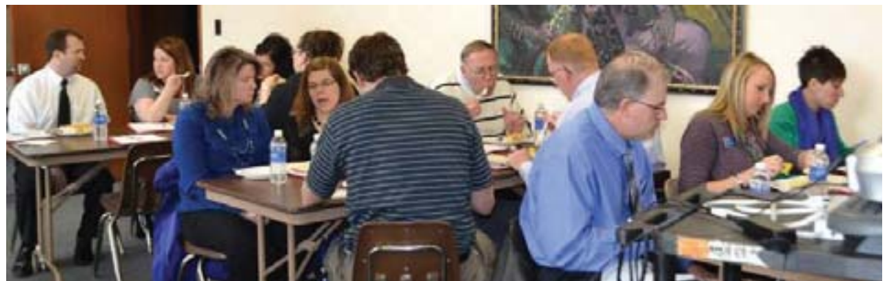
Each year, the Chamber enlists the hard work of more than 60 volunteers to run the TRC.