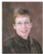
Bonnie Chrt Processor