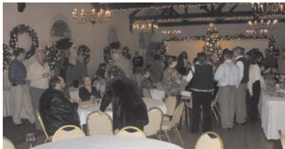
Attendees at the 2nd Annual Sip.Savor.Support. Wine Tasting event enjoy John Ernest wines and good conversation.