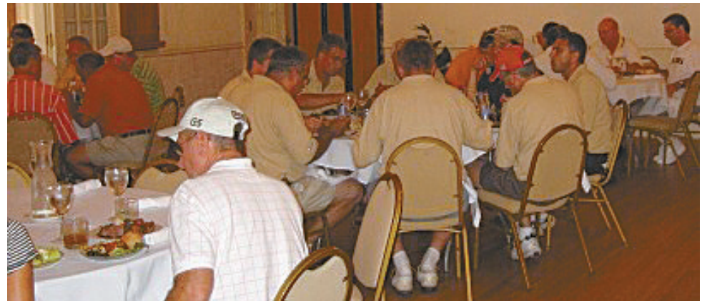
Golfers enjoy the banquet meal during the annual Ambassadors Golf Outing. For more pictures, turn to page 16.