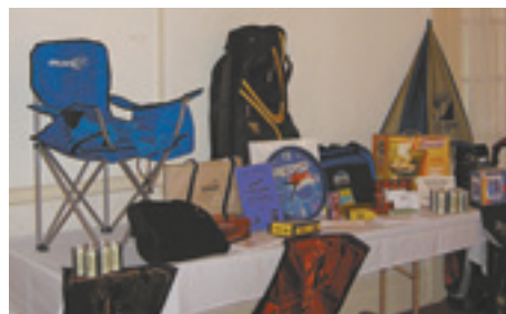
A number of local businesses donated prizes for the outing. For a complete list of prize sponsors, turn to page 16.

Congratulations to all of the flight winners!