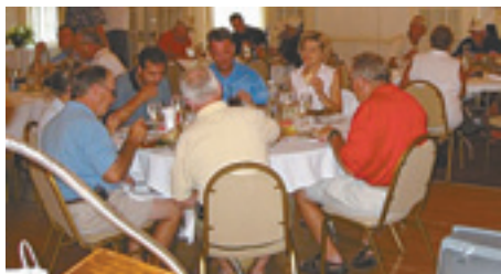
(Above): Golfers relax at Elmwood Country Club after 18 holes of golf.