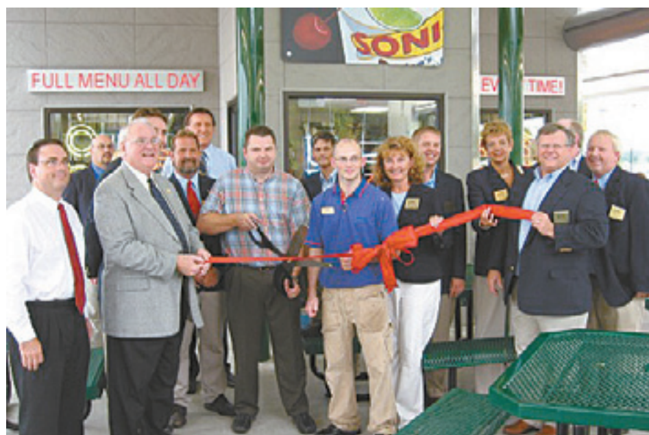
The Chamber Ambassadors visited employees at Sonic Drive-In Restaurant, 10 Lafrentz Lane, for a ribbon cutting on Tuesday, August 14. Sonic Drive-In Restaurant is open daily 6:00 a.m. to Midnight.