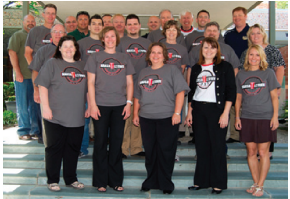
Members of the RAGBRAI planning committee.