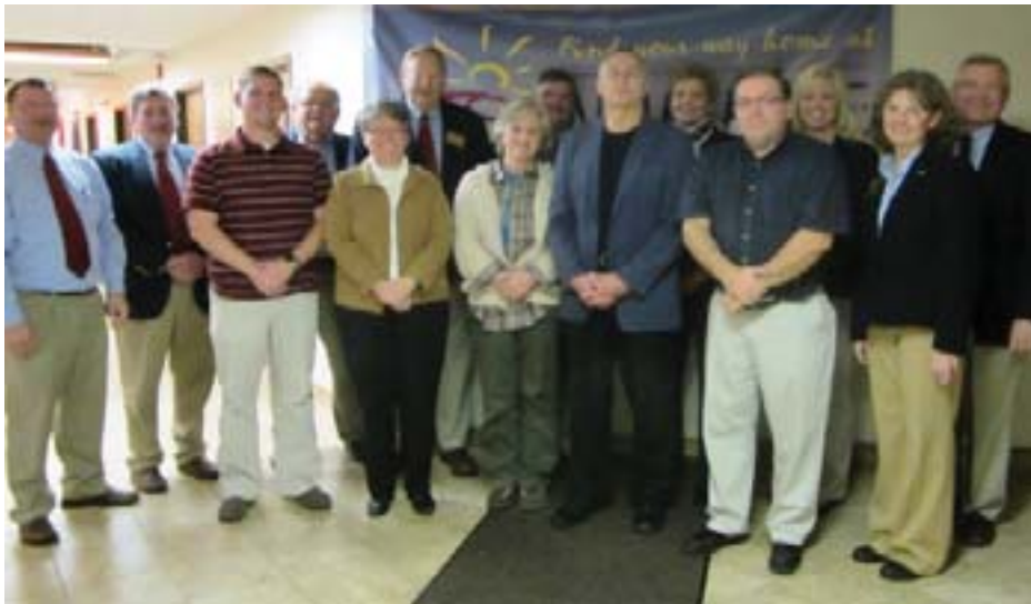
The Chamber Ambassadors visited New Hope Christian Church (3901 South Center Street) on November 8 for a courtesy call. The church has been a Chamber member since 2004.