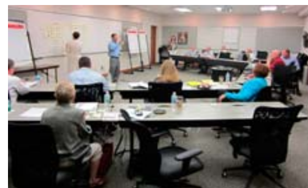
Business-Education Alliance meeting.

Several areas of priority have been identified by members of the Alliance, including assisting the school district in creating a positive learning environment, engaging business leaders in education on all levels, improving community perceptions and attitudes towards the educational system, and partnering on legislative advocacy.