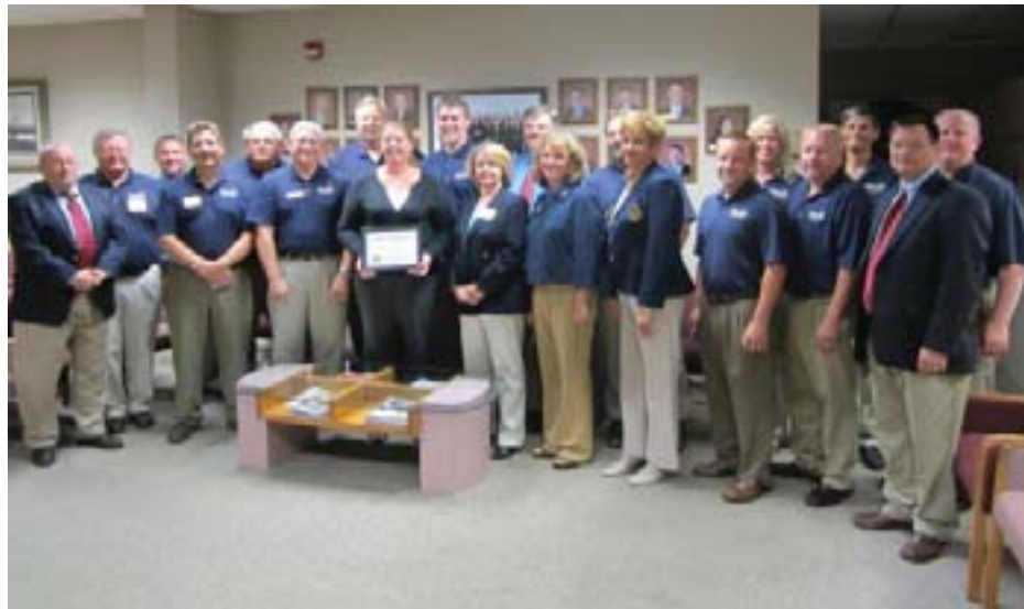
The Chamber Ambassadors learned about the history of Wolfe Clinic (309 East Church Street) during a courtesy call on September 13.

See pictures of past Ambassadors ribbon cuttings and courtesy calls on the Chamber website at www.marshalltown.org .