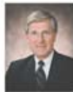
Laras Neuroth Agent