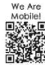
We Are Mobile! Scan With Your Mobile Device