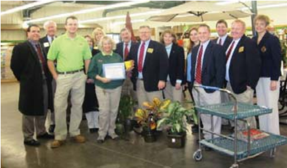
The Chamber Ambassadors enjoyed a visit to Earl May (3001 South Center Street) on February 22 during a courtesy call. The store has been a Chamber member for more than 45 years.