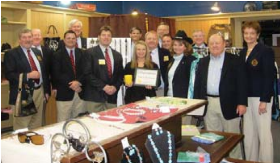
The Chamber Ambassadors visited Back at the Ranch (16 W Main St) during a courtesy call on March 8. The store features western-themed apparel, including hats, boots and jewelry.