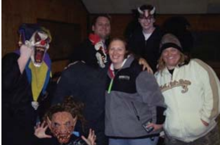
Above: A group of Jaycees pose during their annual Haunted Forest event around Halloween.