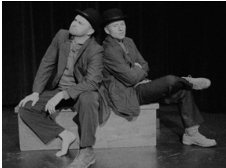
Actors Theatre of Grinnell will present Waiting for Godot March 4 in Marshalltown.