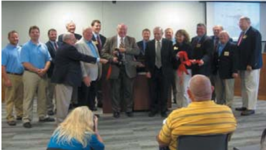
Mayor Gene Beach cuts the ribbon, celebrating the completion of renovation to the City Hall Complex, including the Historic Carnegie Building, City Hall and the Liese Addition, at the September 14 open house.

See pictures of past Ambassadors ribbon cuttings and courtesy calls on the Chamber website at www.marshalltown.org .