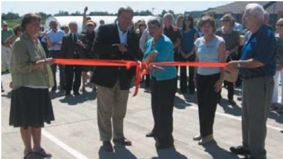
Congressman Tom Latham prepares to cut the ribbon at the August 27 Rural Entrepreneurship Incubator – Phase I Project ribbon cutting. The center is part of Marshalltown Community College (3700 South Center Street).