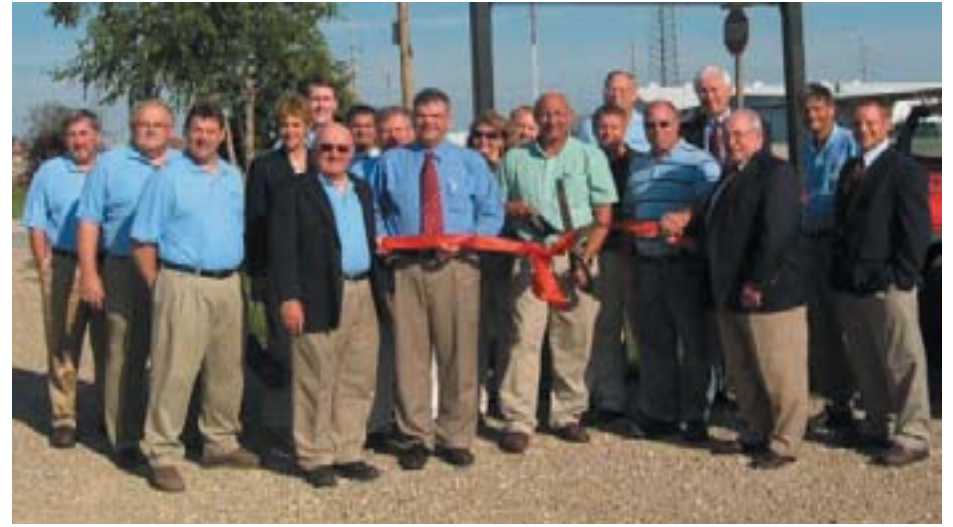
The Chamber Ambassadors welcomed new business Floors and More to Marshalltown with a ribbon cutting on August 24. Floors and More is located at 3211 S. 14th St. and specializes in a variety of flooring products.