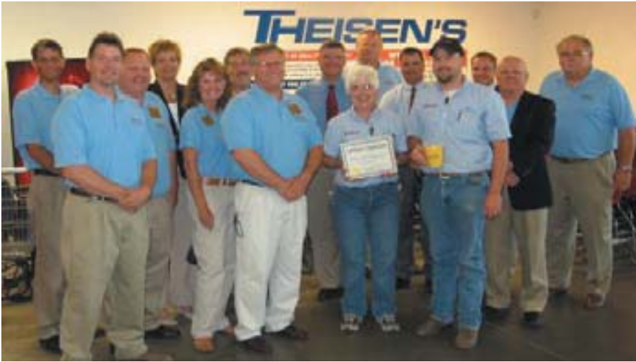
The staff at Theisen's Home-Farm-Auto were visited by the Chamber Ambassadors on August 24 for a courtesy call. Theisen's is located at 602 Iowa Avenue West and has been a Chamber members since 2000.