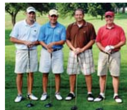
Champions: Emerson Process Management - Fisher Division team.

Thank you to everyone who golfed, volunteered, donated a prize or sponsored this great event! Mark your calendars now for next year's event on Thursday, August 18, 2011 at Elmwood Country Club.