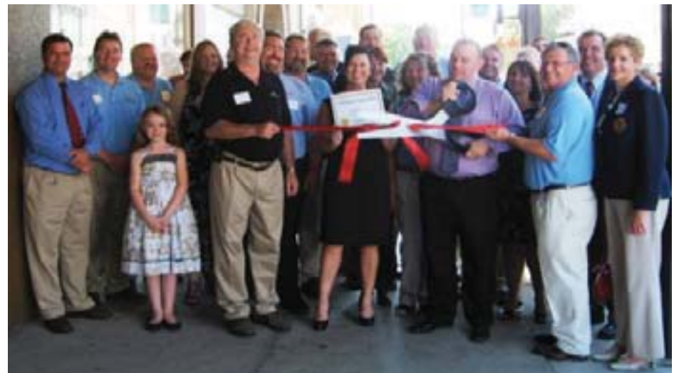
The Chamber Ambassadors celebrated the grand opening of Envision (30 West Main Street) with a ribbon cutting on August 10. Pictured with the Ambassadors are members of the corporate and local Envision team.

The Ambassadors are the goodwill arm of the Chamber. Their scheduled time for courtesy calls and ribbon cuttings are at 4:30 p.m. and 4:45 p.m. on the second and fourth Tuesday of the month.