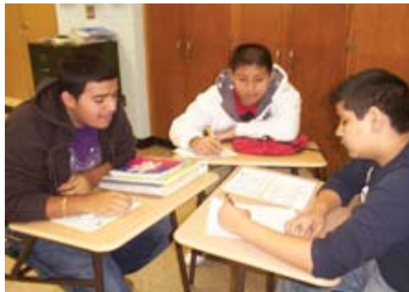
Dual Language students participate in learning apprenticeships.