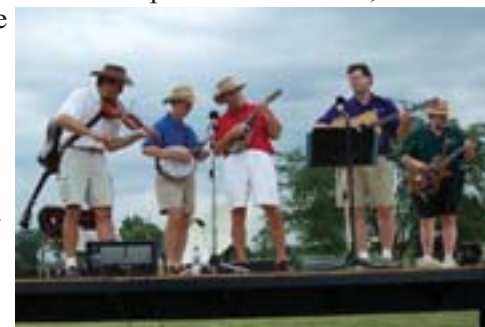
Lincoln Highway Band