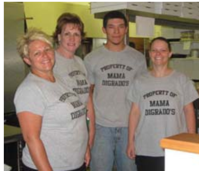
The staff at Mama DiGrado's take pride in making fresh, delicious Italian cuisine.

To see the variety of items on the menus please visit them at www.mamadigrados.com or stop by their restaurant located at 718 South Center Street in Marshalltown.