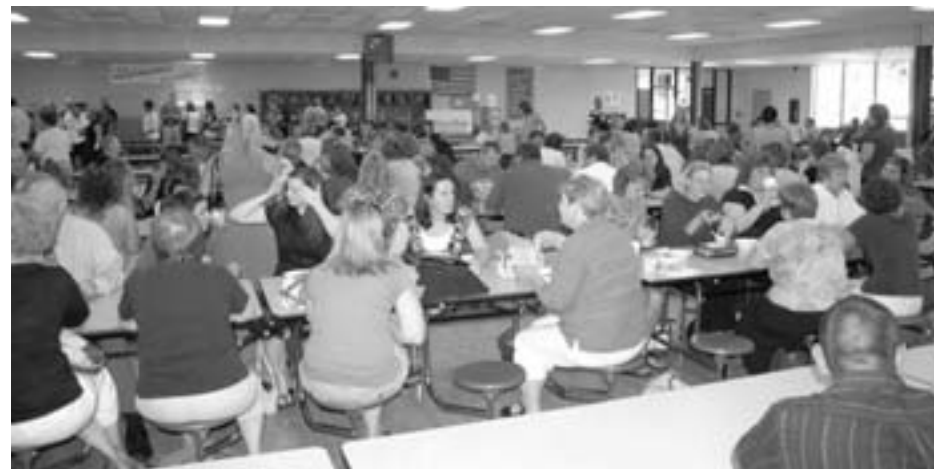
2009 Educator Appreciation breakfast at MHS cafeteria

The Educator Appreciation breakfast is open to all Marshalltown Community School District, Marshalltown Area Catholic Schools (MACS) and Marshalltown Christian School administrators, educators and support personnel.