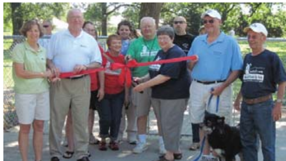
The Marshalltown Dog Park (at Riverview Park) celebrated the grand opening of the dog park on Saturday, June 18 with a ribbon cutting. City staff, volunteers and 4-legged friends enjoyed the grand opening.

The Ambassadors are the goodwill arm of the Chamber. Their scheduled time for courtesy calls and ribbon cuttings are at