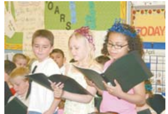
Poetry reading at Hoglan Elementary.