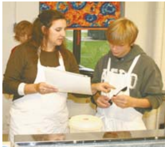
Miller Middle School Life Skills class.

The district serves close to 5,100 students and employs nearly 850 people, including faculty, administration and support staff.