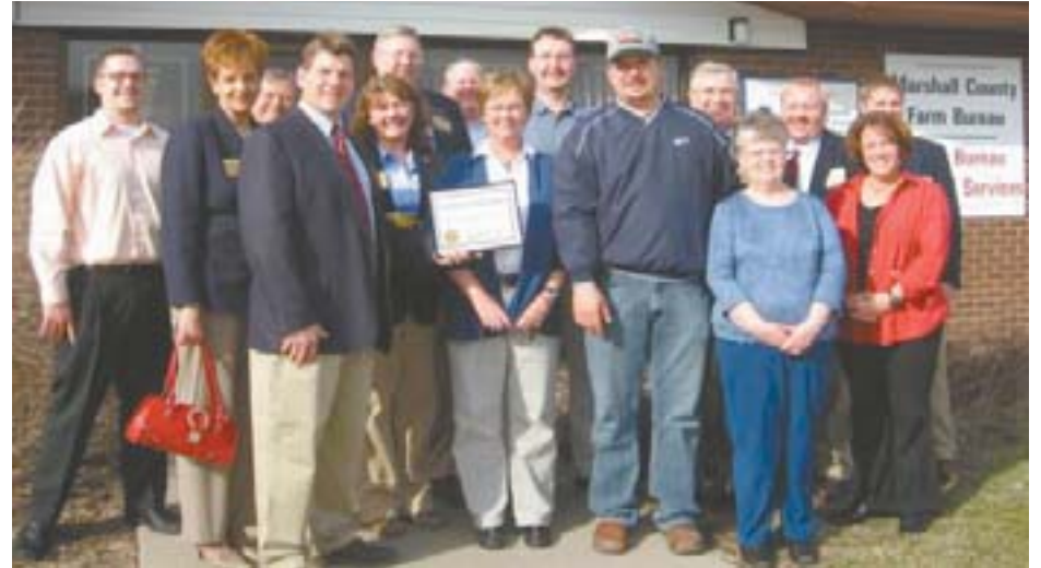
Staff and board members of Marshall County Farm Bureau, 3205 South 6th Street, were visited by the Chamber Ambassadors on March 23 to celebrate their more than 45 years as members of the Chamber.