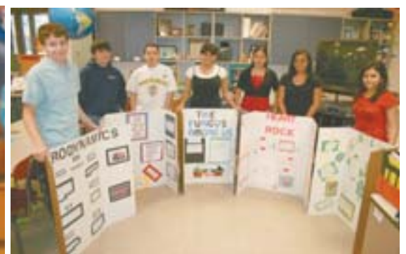
Above: Science Bound students at Miller.