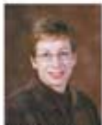
Bonnie Ghrl Processor