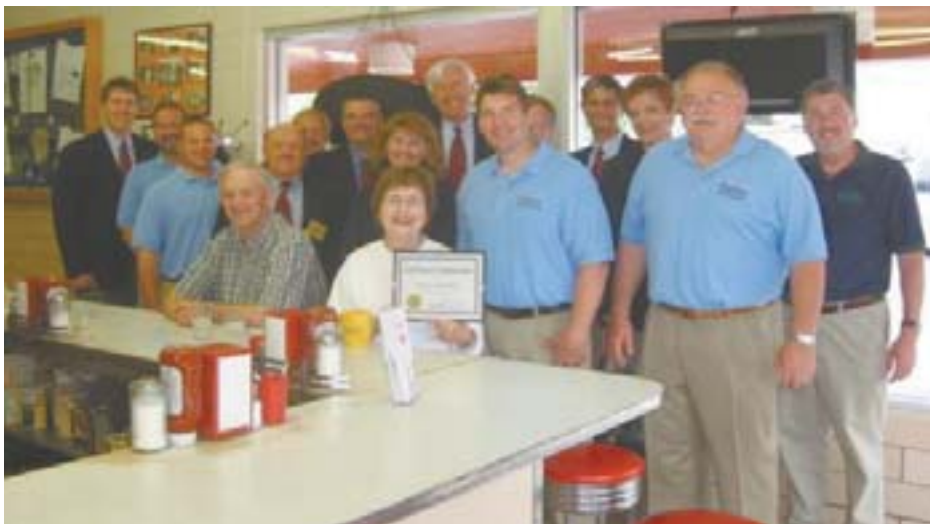
The Chamber Ambassadors visited one of Marshalltown's icons Taylor's Maid-Rite during a courtesy call on June 9. The business is located at 106 South 3rd Avenue and specializes in maid-rite sandwiches and malts.