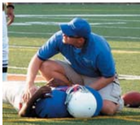
One of the many services SportsPlus provides is athletic training for a number of local high schools.

“I think it’s important to be a Chamber Member and support the Chamber because it works for the business community of Marshalltown and for the community as a whole to help promote local businesses. It is a source of information as well, helping to keep business people in tune with things that are going on in other parts of the state and country. I also think that by being a Chamber member, it lends some credibility to a company and lets others know that the business is willing to be invested in the community and is going to help to make the community a stronger place,” he said.