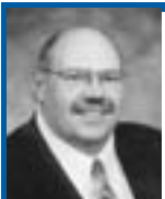
Mac Copenhaver Administration

On Sunday, stop by the show for a display by the Central Iowa Art Association, face painting for kids and much more!