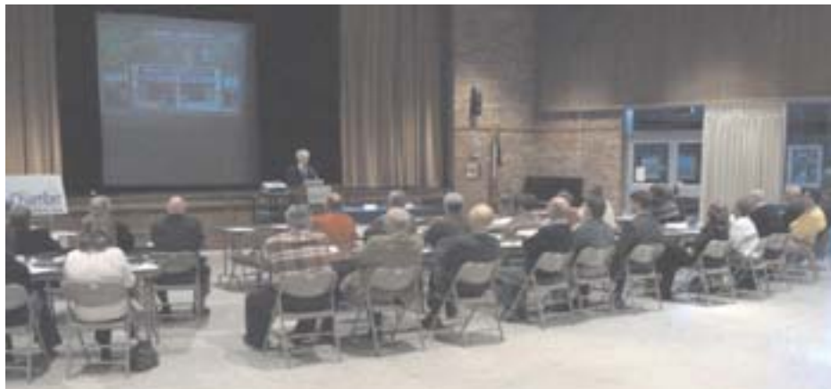
Business leaders gather at the Fisher Community Center to hear about upcoming state and federal legislative issues.

Loon reported that Federal transportation authorization bill expires in 2009, healthcare access and costs, taxes and what the stimulus package includes are all factors as Congress works with the new administration.