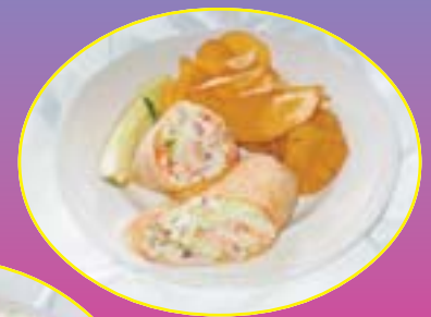
Chicken BLT Wrap & Chips