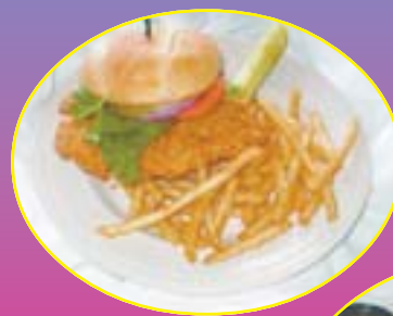
Homemade Tenderloin Sandwich & Coleslaw or Fries

"We Invite Your Lunch Bunch" To Try Our NEW MENU!