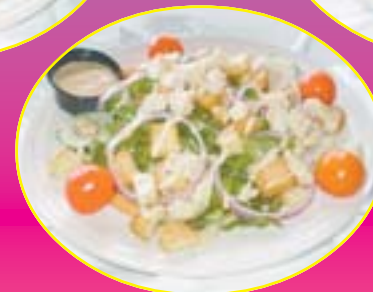
Caesar Salad $5.50