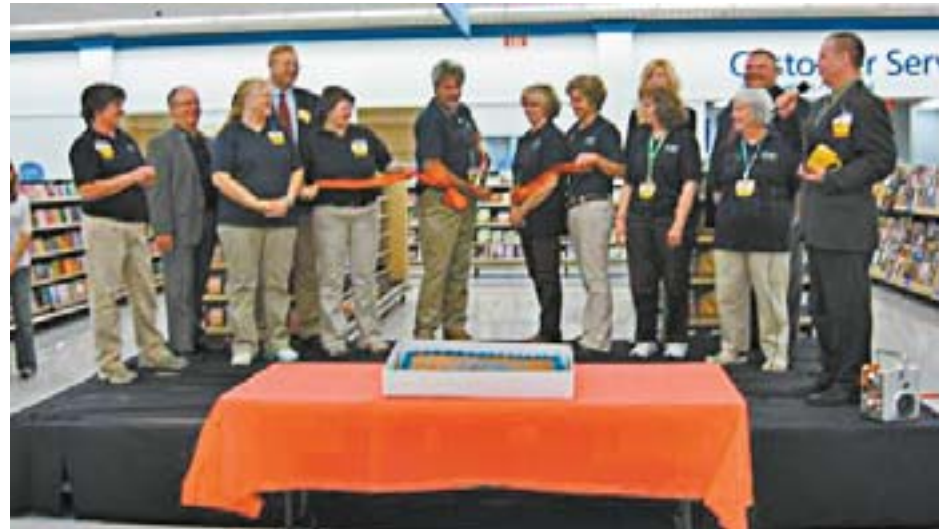
Community members, Chamber representatives, shoppers, Walmart management and associates celebrated the Grand Re-opening of the Walmart Supercenter, 2802 S. Center Street on October 15. The celebration included the Presenting of the Colors by the Sea Cadets, singing of "The Star Spangled Banner" by members of the MHS vocal department, celebration of 30 year Walmart employees, donation presentations to local organizations and a ribbon cutting.