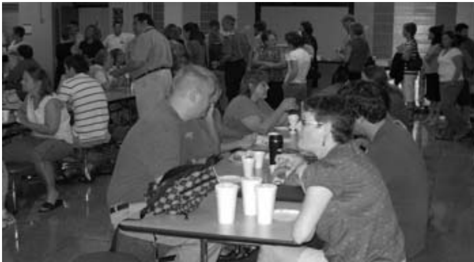
Teachers enjoy donuts, muffins, coffee and juice at the 2007 Educator appreciation breakfast, held at the MHS cafeteria.