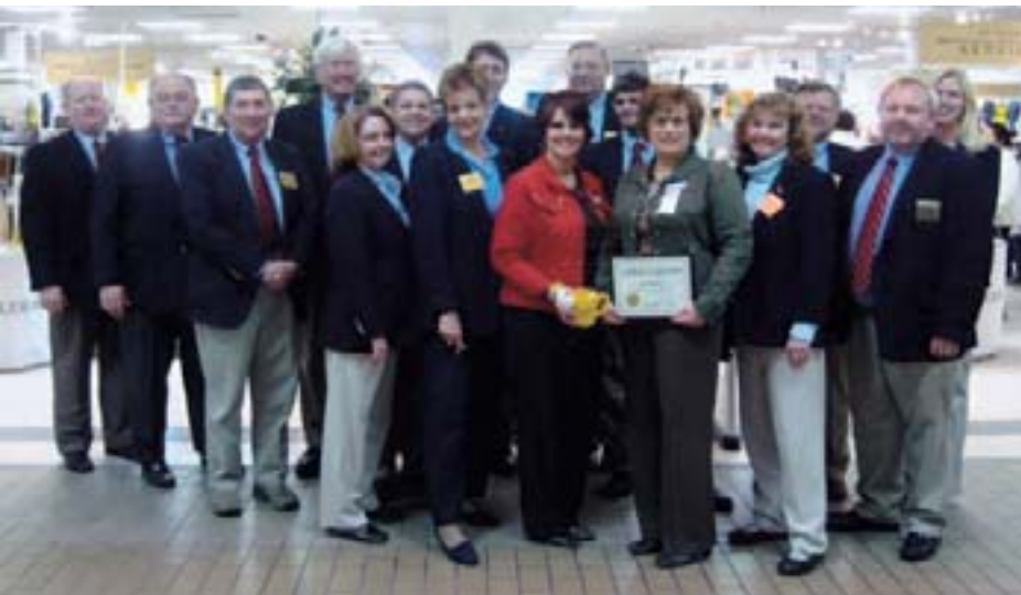
The Chamber Ambassadors thanked Younkers staff during a courtesy call on Tuesday, March 11. Younkers, located at 2500 South Center Street, has been a member of the Chamber for more than 45 years.

See pictures of past Ambassadors ribbon cuttings and courtesy calls on the Chamber website at www.marshalltown.org .