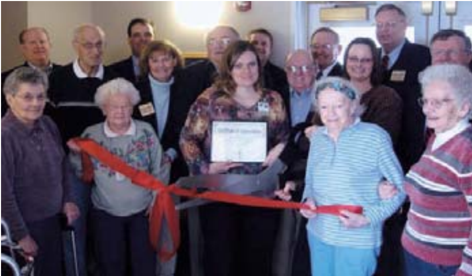
The staff and residents of Glenwood Place, 2907 South 6th Street, celebrate their new edition with a ribbon cutting on Tuesday, February 26.