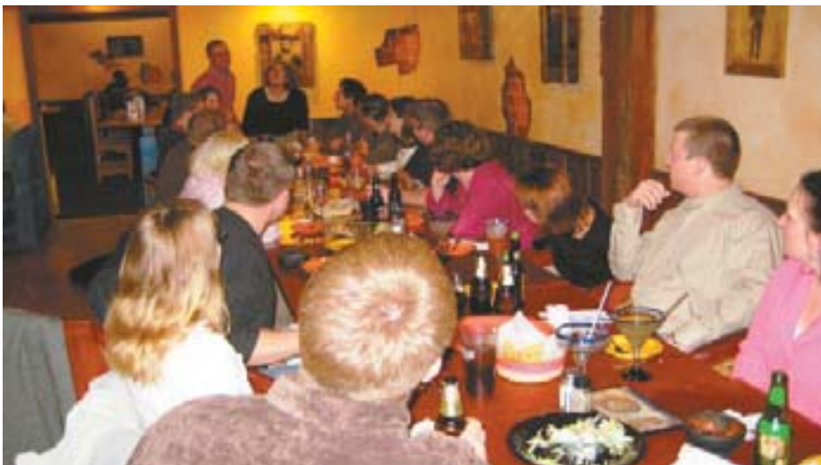
MYP members gather at Mexico Antiguo on Saturday, February 16 for a Progressive Dinner through downtown Marshalltown. For more information on the organization, visit www.marshalltownyp.com .

The Marshalltown Young Professionals' mission is to inform, connect, refer business and engage members in the growth and success of our community through social gatherings, facilitating professional development opportunities and welcoming new young professionals to the Marshalltown area. If you know of an individual who may be a candidate for membership in the organization, please contact the Chamber office.