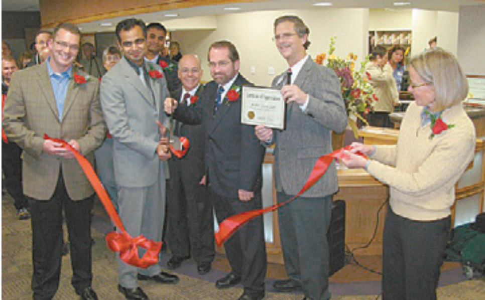
MMSC Staff, volunteers, community members, Chamber staff and Ambassadors were on hand Sunday, December 5 for a ribbon cutting and open house at the MMSC Cardio Cath Lab.