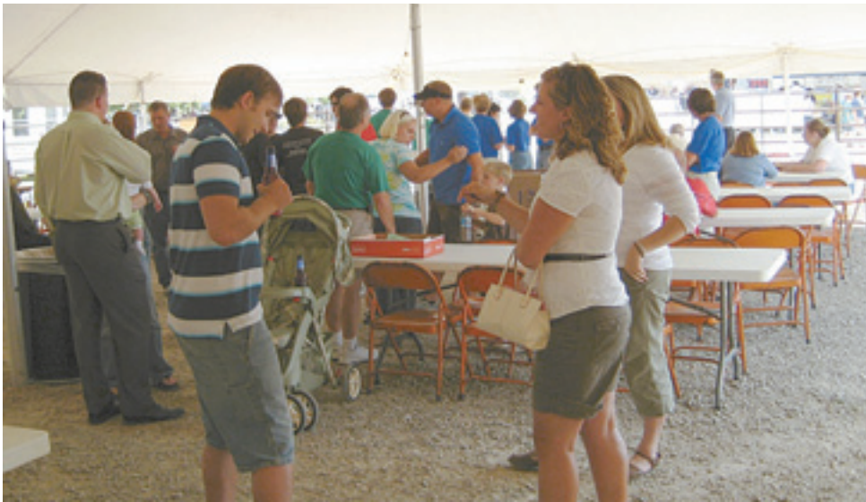
Chamber members enjoy Business After Hours hosted by the Central Iowa Fair on Wednesday, July 11. The August Business After Hours will be held at AmericInn Motel and Suites on Wednesday, August 22.