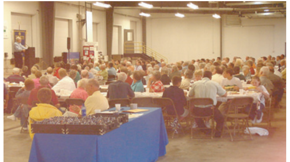
Marshalltown Rotary Club, Marshall County Farm Bureau and Marshalltown Area Chamber of Commerce members attend the 2006 Rural - Urban Dinner hosted by Consumers Energy. The 2007 Rural - Urban Dinner will be held on Tuesday, August 21, beginning at 5:30 p.m. at Consumers Energy. For more information, contact the Chamber office at 641-753-6645.