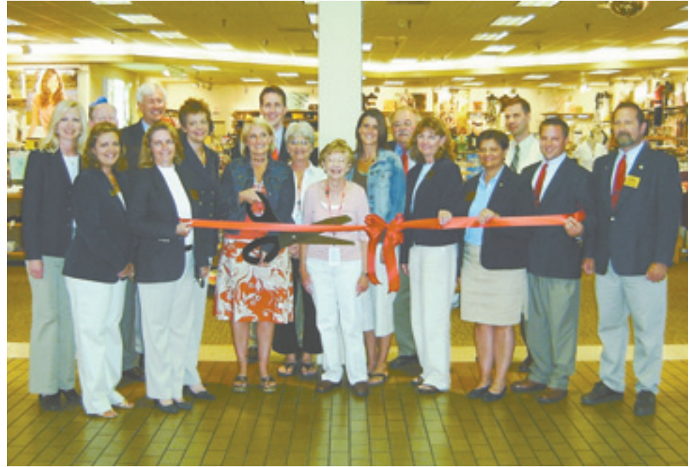
The Chamber Ambassadors hosted a ribbon cutting at Maurices at Marshall Town Center on June 19 after a recent store remodel.