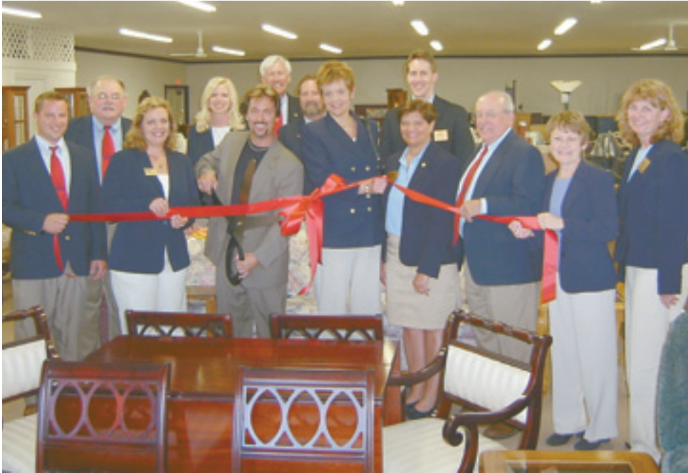
On June 19, the Chamber Ambassadors visited J. Wells Furniture Outlet on Iowa Avenue West, near Stalzer Furniture for a ribbon cutting.