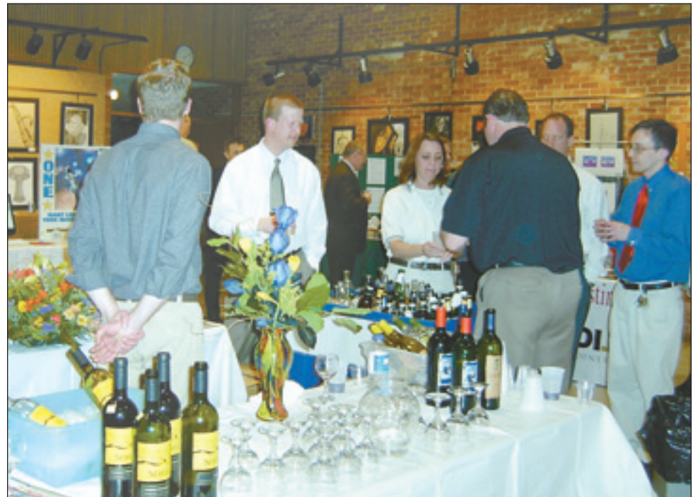
Hy-Vee hosted the first Business to Business Showcase of the year on March 7. June’s event will be combined with the Chamber Annual Meeting.

To register, contact the Chamber office at 753-6645 or visit www.marshalltown.org/chamber/events .