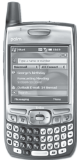
Palm Treo 700.