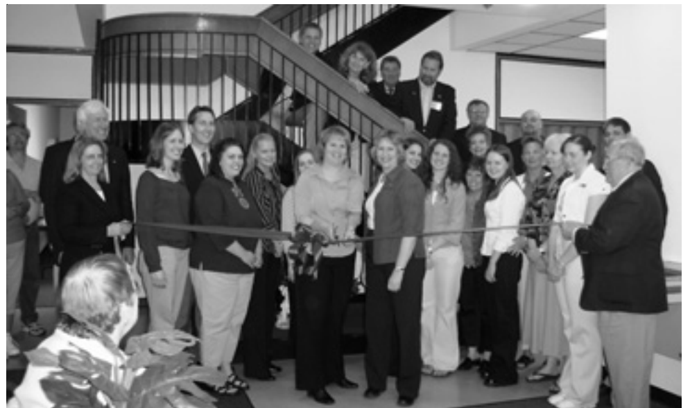
The Chamber Ambassadors hosted a ribbon cutting at Child Abuse Prevention Services at their new location at 811 East Main Street on April 24.