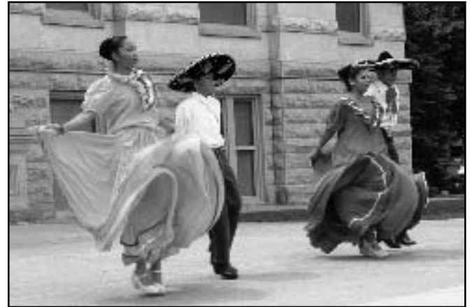
The annual Hispanic Heritage Festival comes to historic downtown Marshalltown on Sat., June 3 rd from 3:00-9:30 pm. Activities include live entertainment, food, and fun for the whole family.