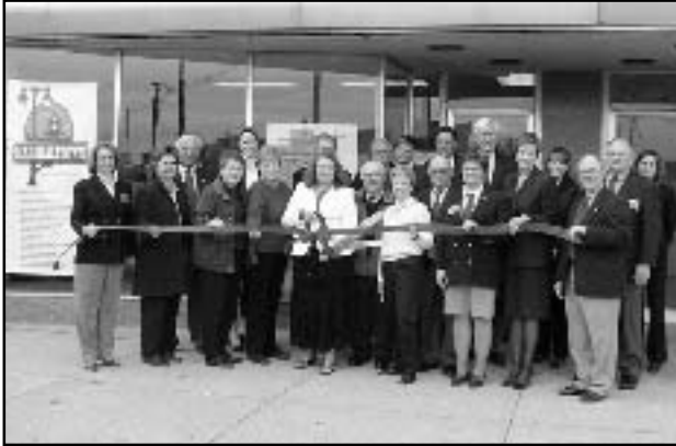
Mainstreet MCBBD held a ribbon cutting on Tues., April 25th to celebrate the new office at 216 East Main Street (left).