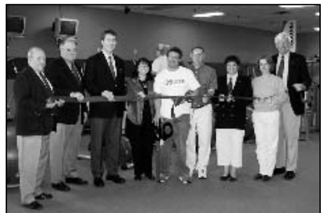
AnytimeFitness held a ribbon cutting on Fri., May 19th to celebrate their newly opened gym at 107 North Center Street (above).