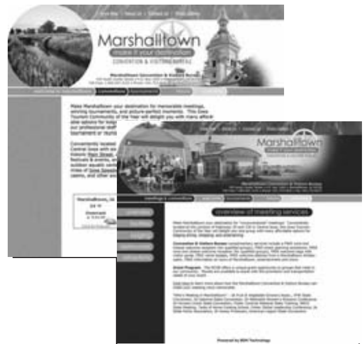
Above and left: New marketing and promotional tools like the website and Official Visitors Guide have been redesigned to reflect the new MCVB brand.