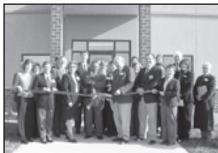
On Jan. 11 a ribbon cutting took place for the new Social Security Office at their location of 2502 South 2nd St.