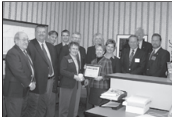
Also on Jan. 10 the Ambassadors met with AIG Financial Advisors, Inc. at their location of 25 South Center St. (formerly SunAmerica Securities)