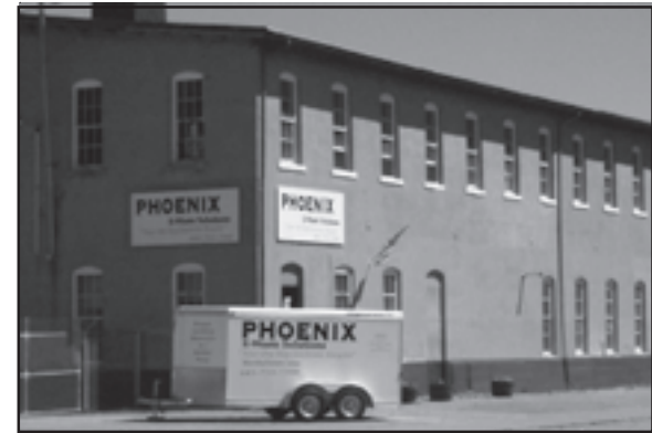
Phoenix E-Waste Solutions provides Central Iowans the means to properly dispose of their obsolete electronics. Area schools, businesses and residents regularly use their services. This waste recycling prevents hazardous materials to harm the environment.

Phoenix started out as a small, local electronic recycler and in less than 2 years covers all of Central Iowa including much of western Iowa. They have had great success in Marshalltown, and are looking forward to growing their business locally. They feel that Marshalltown is the perfect location for their business because Marshalltown: is located 1 hour from over 1 mil. people; is centrally located between Ames, Des Moines, Waterloo/Cedar Falls and Cedar Rapids; has 4-lane access to Iowa's biggest population base only 45 minutes away; has a great workforce; maintains its small town atmosphere while providing all the services and amenities that larger towns claim; is a great place to work, live, raise your family.