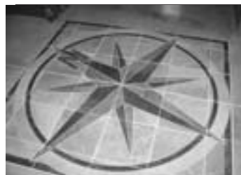
Above: The inspiration for the new logo was this compass rose tile design in the foyer of the Grimes Farm Conservation Center