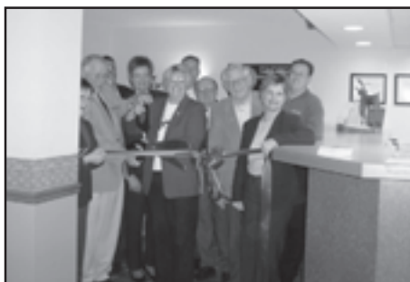
On Dec. 14 a ribbon cutting took place at the new Super 8 Motel located at 3315 South Center St.