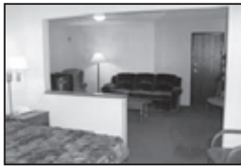
A view inside of the newly remodeled suite at the Super 8 Motel.

For the time and a description of the events below, log on to the MCVB website’s Calendar of Events... www.VisitMarshalltown.com