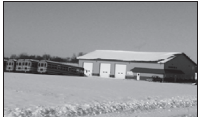
Hoglund Bus Company recently completed their new building in the Marshalltown Industrial Park. They have been a part of the Marshalltown business community since 1999.

Hoglund Bus Company's expansion in Marshalltown is one more example of how Marshalltown Works for Business, and our central Iowa location is a great business advantage.