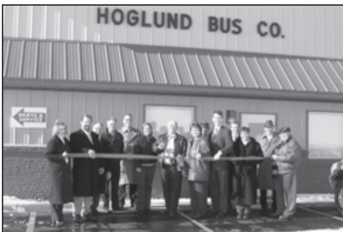
A ribbon cutting ceremony took place on Dec. 1 for the Hoglund Bus Company at their new location 823 South 19th Avenue.