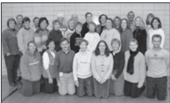
The Rogers Elementary School Staff received a MEDIC Partner award for their generous financial support at the recent MEDIC Recognition event.