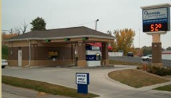
Marshalltown Drive-Up 2201 South Center St.