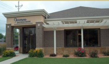
Marshalltown Main Office 205 W. Main St.

We strive to provide our customers with top-level products and services using the utmost integrity and honesty. Farmers Savings Bank's knowledgeable and experienced staff is eager to work with you to help you achieve your financial goals by truly getting to know you and your needs.